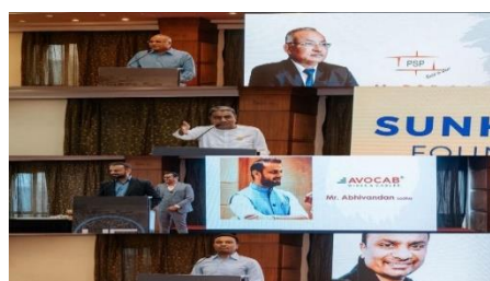
United First Initiative